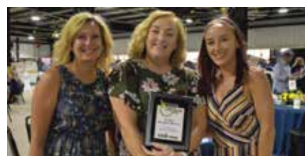
Stars of Delaware awardees celebrate their 2022 win.