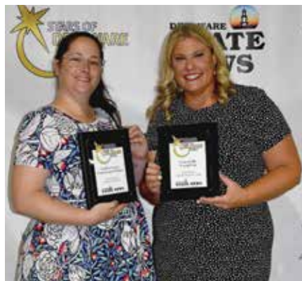
Stars of Delaware awardees celebrate their 2022 win.