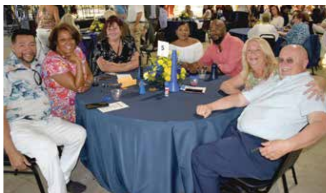
LakeView Realty celebrate their 2022 Stars of Delaware wins.