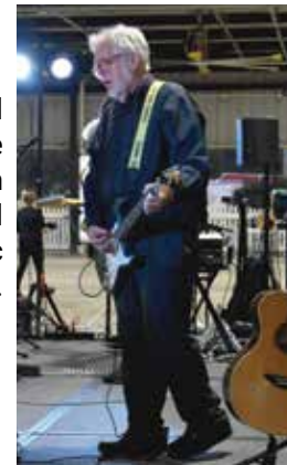
Club Phred rocked the hall with popular and rock music all night.