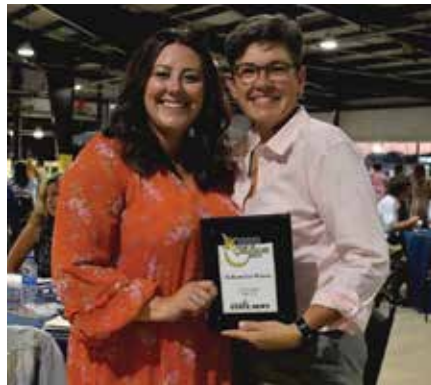
Stars of Delaware awardees celebrate their 2022 win.