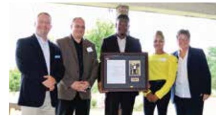
Dover Federal Credit Union wins Large Business of the Year Award

It is imperative that the members of the CDCC business community support each other's success. There is so much good happening in Kent County that it is hard to choose a "best" (trust us, we know!). Nomination forms can be found in this month's CDCC mailer and will be available online. For more information about making nominations, please call the CDCC Office at (302) 734-7513 and check