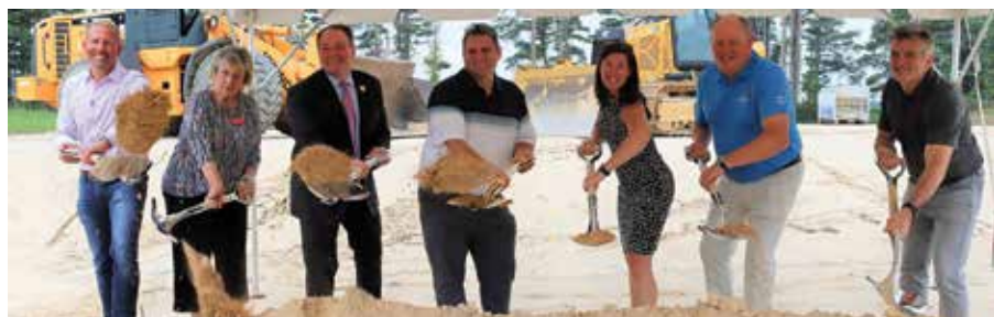
A CDCC Groundbreaking Ceremony National Vinyl Products, a Barrett Outdoor Living Company in Dover in August 2022.

Economic development takes a village; The CDCC couldn't do it without our hard-working partners, members, businesses, and community all working together creating synergy that blooms into a vibrant, expansive, and wholesome society for the bright future to come. Thank you for being along with us every step of the way!