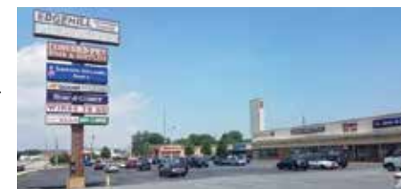
Commercial assets like the Edgehill Shopping Center on Route 13 in Dover are one of the many properties in Delaware that R&R provides property management services for.

For additional information about R&R Commercial Realty and its extensive inventory of commercial property, call 302-674-3400, email info@randrcommercialrealty.com or visit the website www.randrcommercialrealty.com .