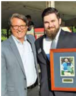
Young Professional of the Year