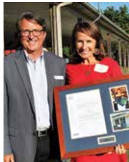
Small Business of the Year