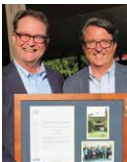
Large Employer of the Year