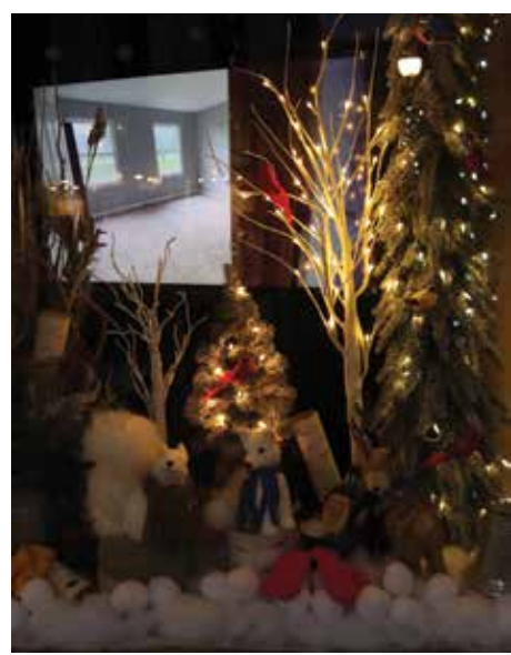
The decorated store windows added a great touch to the downtown.