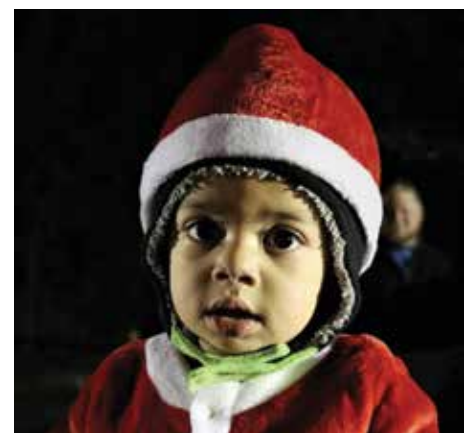
Look at those eyes!