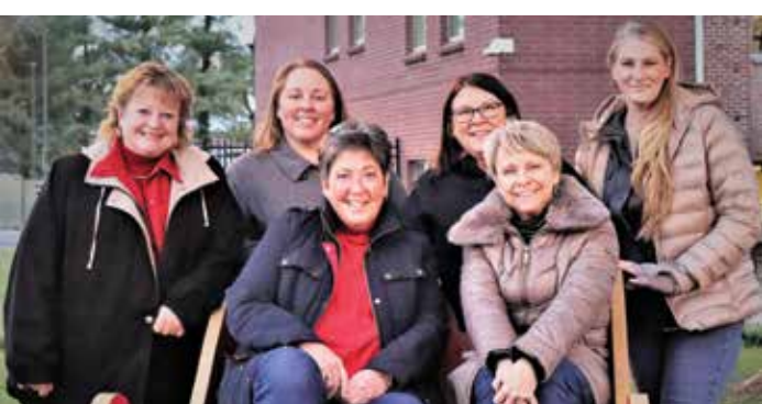
Merry Christmas from the CDCC Team.