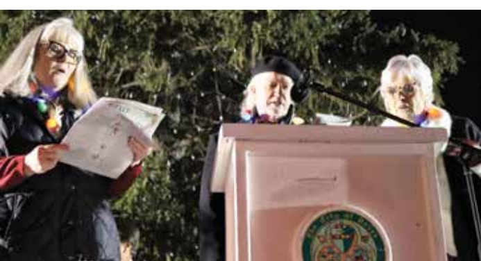
Rockin' Around the Christmas Tree with the Delaware State News!