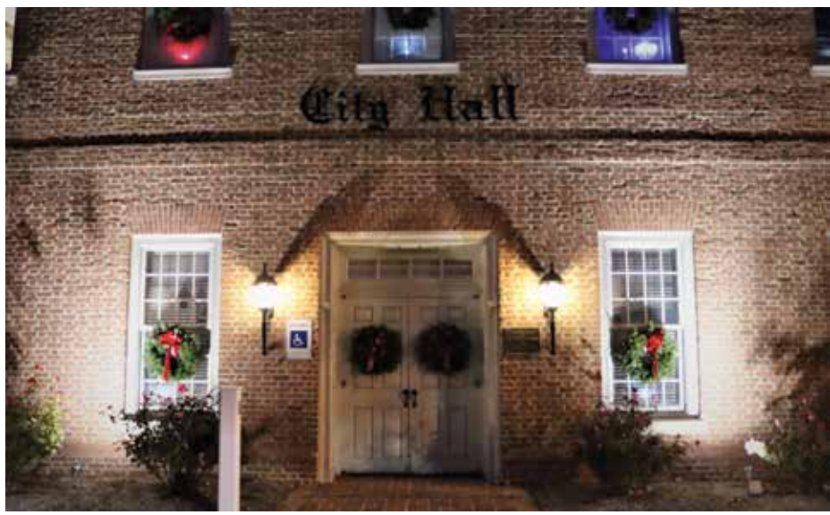
City Hall decorations are always beautiful.