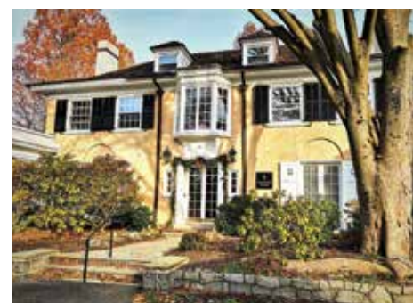
The newest location in Greenville