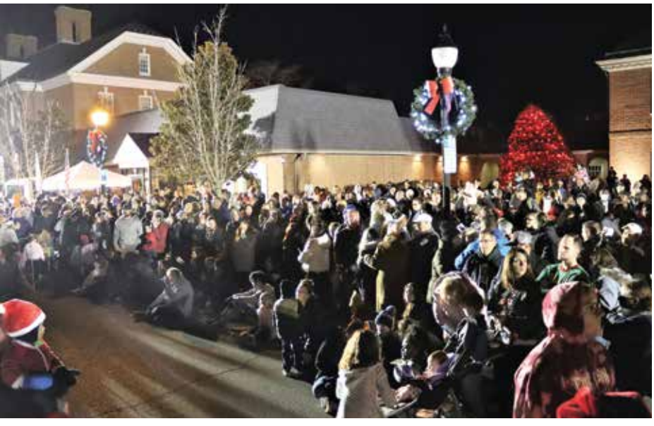
There was quite a crowd of participants!