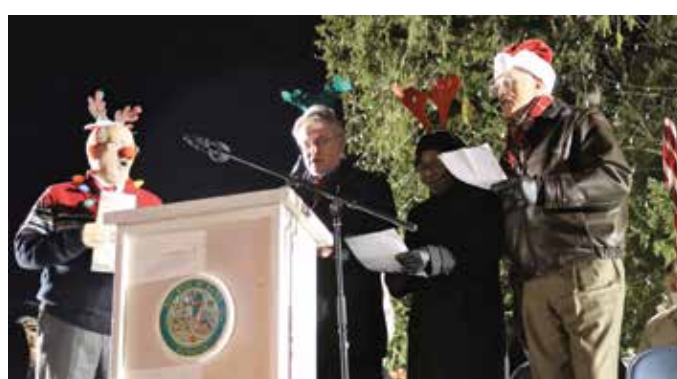
Caroling by local dignitaries is a favorite portion of the event.