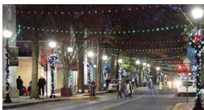
Downtown Dover loves to light it up!