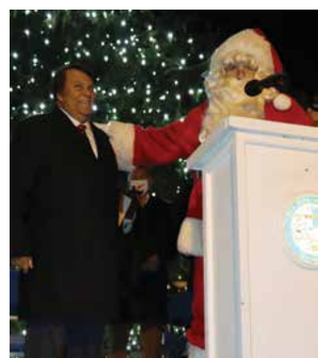
Santa made a list and checked it twice – and Mr. Mayor's been very nice!