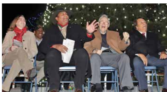
A jolly moment with members of the city council.