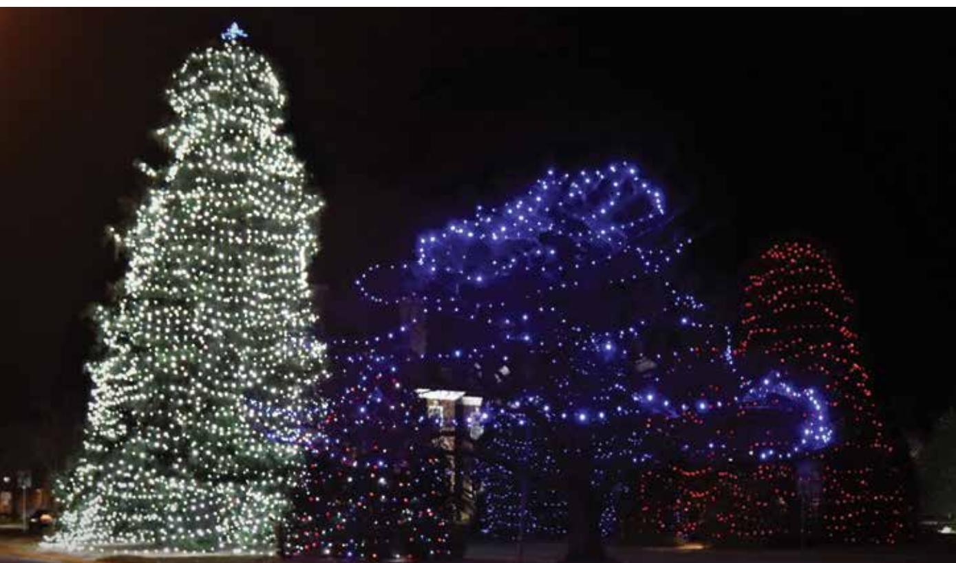
The Downtown lights are so pretty.