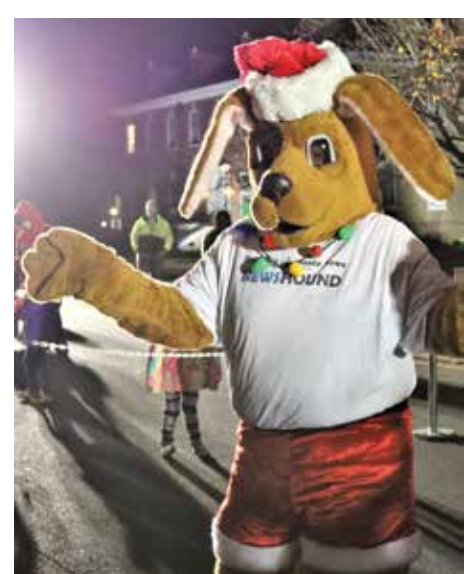
The Newshound was even dancing!