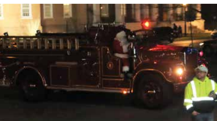
Santa arrived right on time!