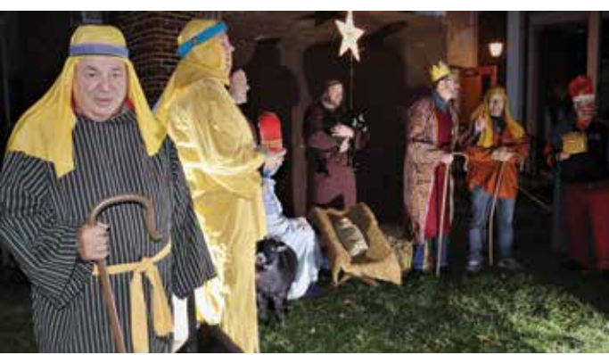
Wesley United Methodist Church provided their annual living nativity.