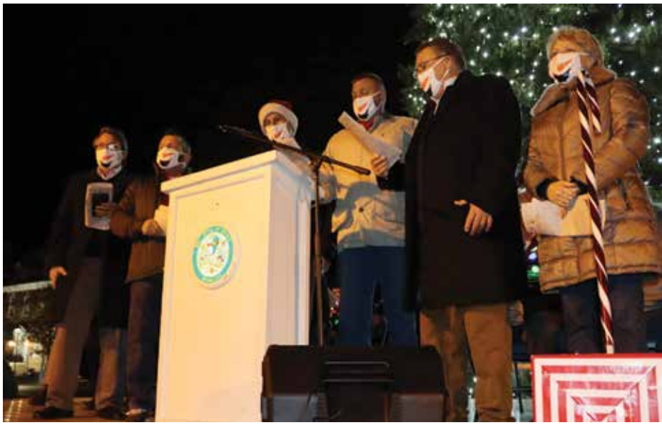
The CDCC Board led a rousing rendition of 'Frosty the Snowman.'