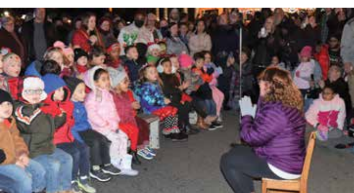
The songs of the children always add so much to the event.