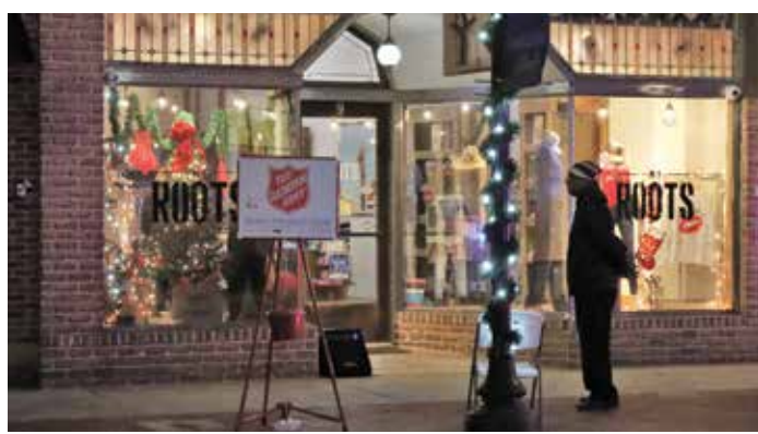
Extended shopping hours gave more time to shop – and to give!